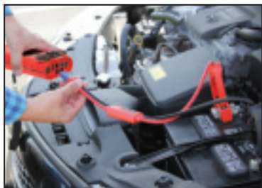
Once it Starts, Disconnect Clamps from Weego 66