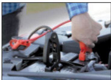
Attach Black (-), Then Red (+)