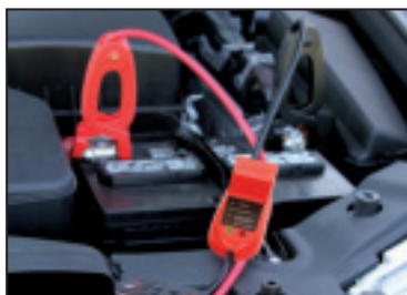
When You Have GREEN LIGHT On Your Smart Box, Start Your Engine