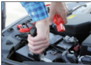
Detach Clamps From Battery