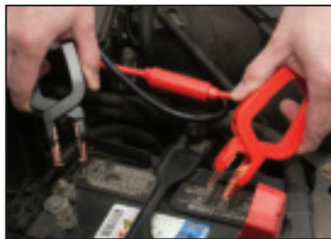
Detach Clamps From Battery