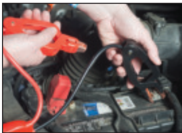
Attach Black (-), Then Red (+)