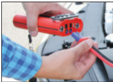
Once it Starts, Disconnect Clamps from Weego 44