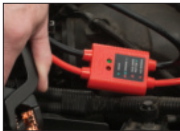
When You Have GREEN LIGHT On Your Smart Box, Start Your Engine